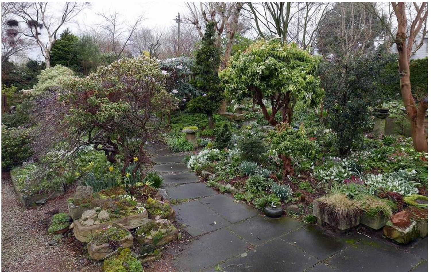
This view looking up the garden was taken in between some of the rain showers some of which lasted several hours.