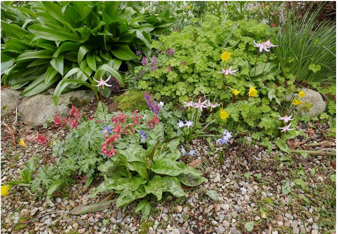
Self-sown subjects flowering in the gravel include Corydalis solidus , Erythronium revolutum and Narcissus bulbocodium .