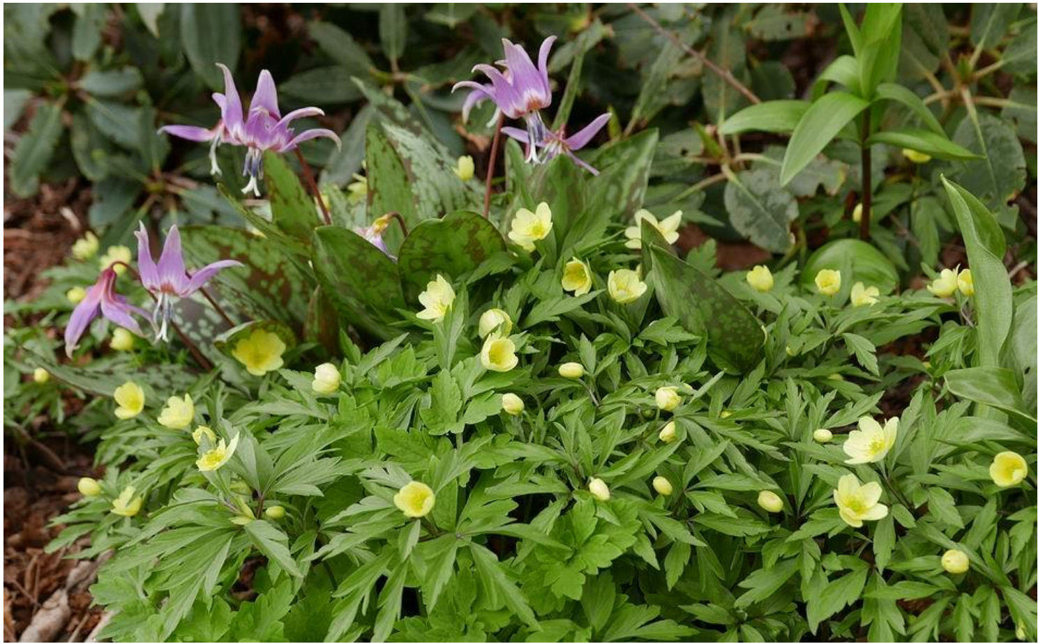
Anemone × lipsiensis with Erythronium dens-canis