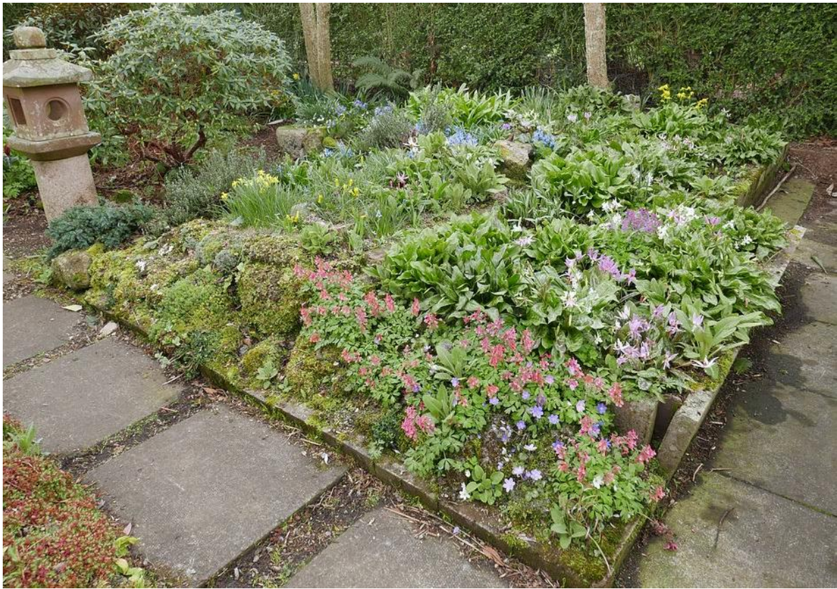
The view of the Erythronium plunge beds with the rock garden and the narrow bed planted with Corydalis and Hepatica nearest the path.