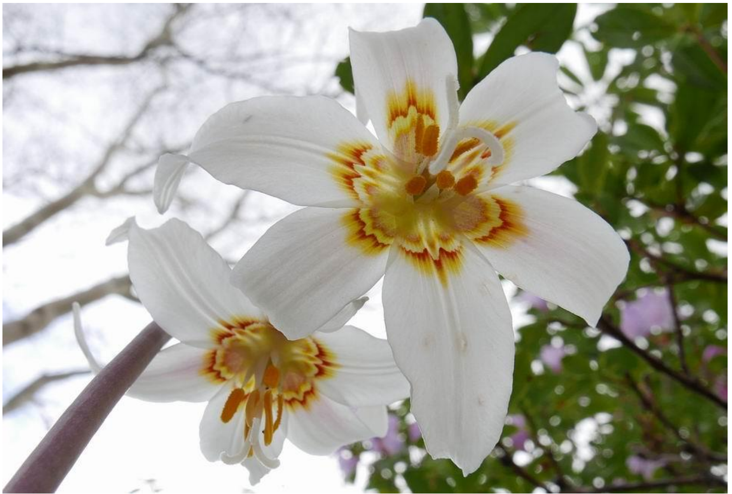
Looking up into the Erythronium oregonum flowers reveals more of their beauty.