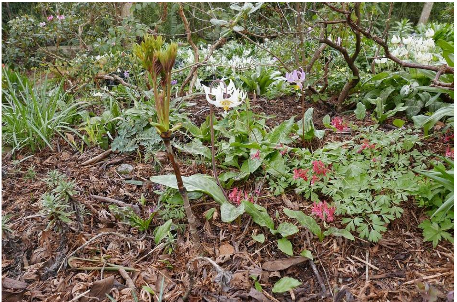
This grouping is mostly of self-seeded subjects including the Paeonia lutea one of many seedlings of various ages spreading out from the large old parent plant which fits in with my desire to mimic nature by having plants of all ages and not just mature specimens. The Erythronium oregonum and Corydalis also arrived by self-seeding and in the foreground you will observe this process continues.