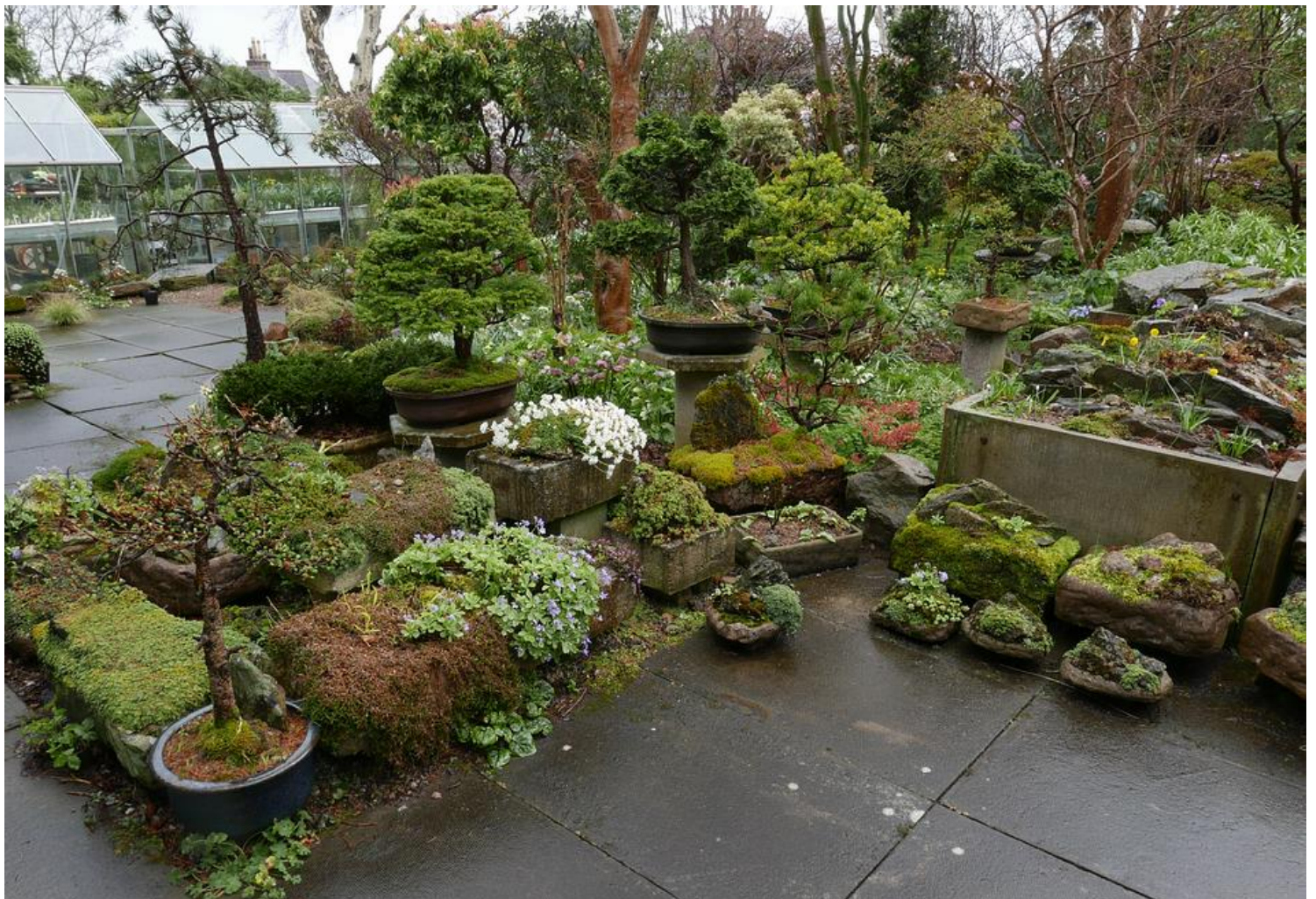
Troughs are an important part of our garden and we have many of different sizes from tiny ones up the the large slab beds which are effectively giant troughs.