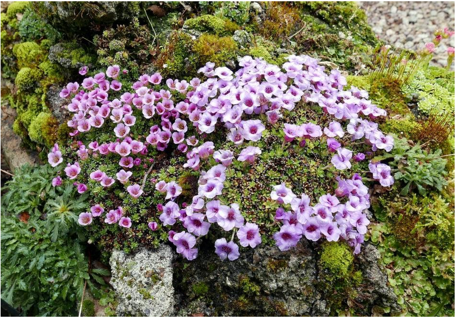
Looking closer Saxifraga 'Martin Luther' and 'Exhibit' are both flowering well.