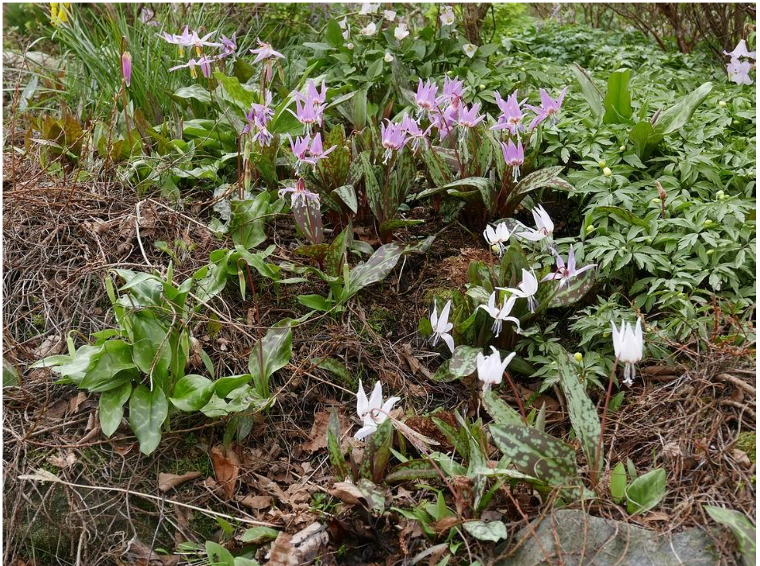
Erythronium dens-canis self-seeding down the wall of the central raised bed.