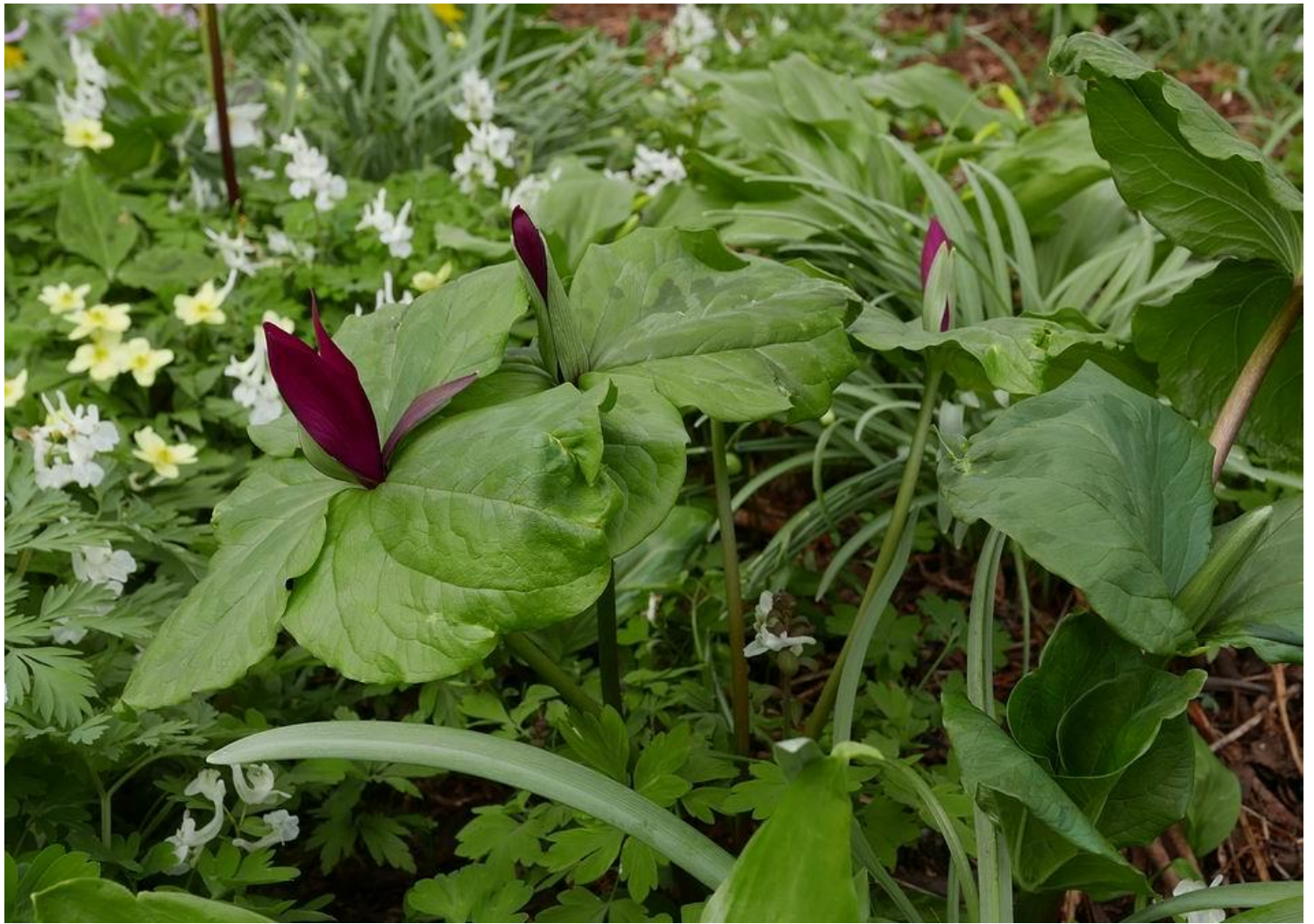
Trillium chloropetalum / kurubayashii