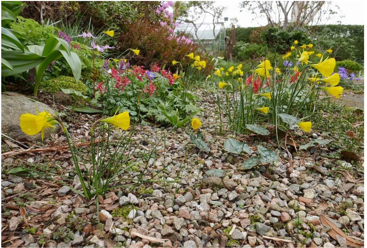
Looking carefully you will see the mass of thin seed leaves of Narcissus bulbocodium seedlings germinating along with 2 nd year and flowering groups – they start to flower in their third year of growth in the gravel.