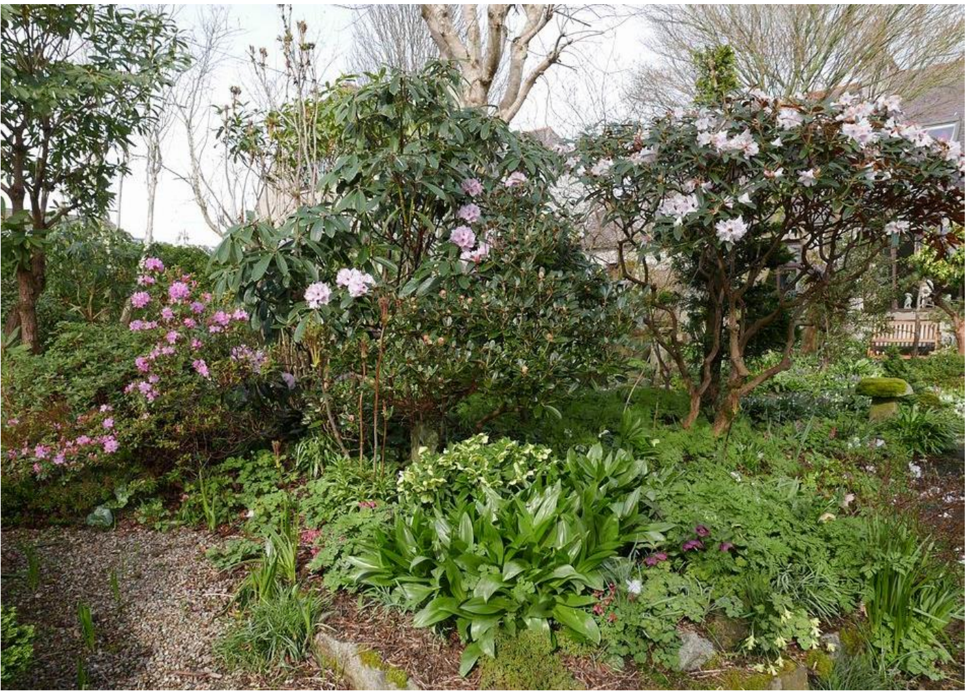
Colour is also starting to appear above our heads with the Rhododendron flowers and the first signs of the leaves emerging on the trees.