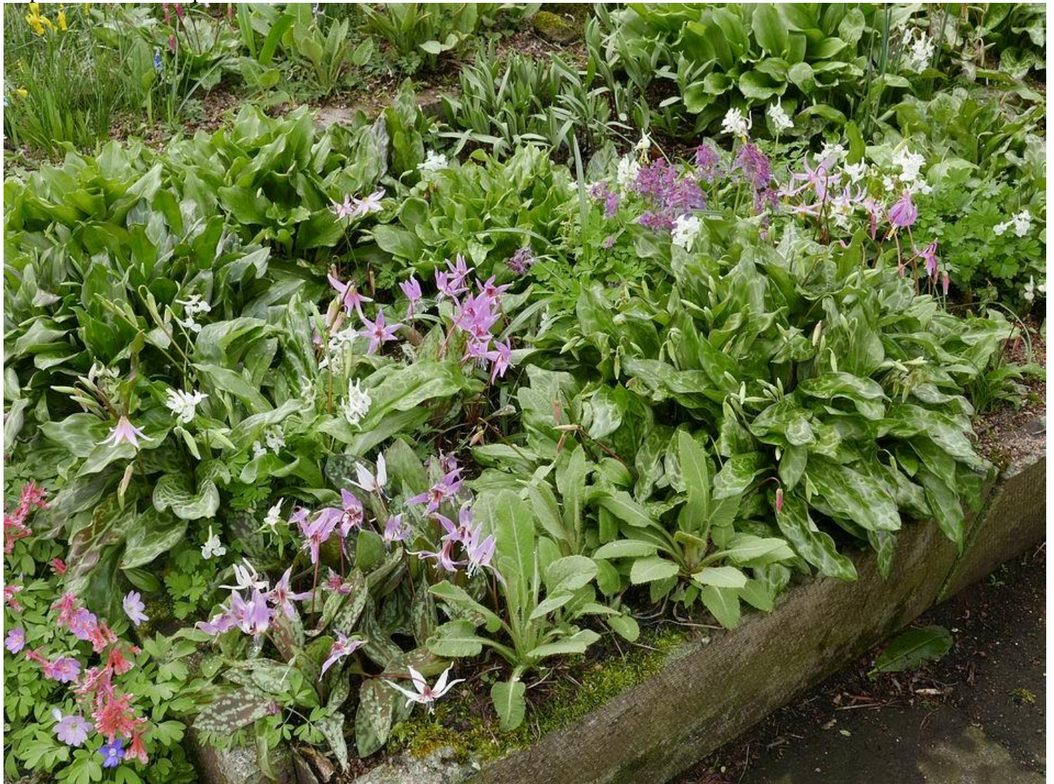
Even in the plunge where the Erythroniums are planted in mesh baskets self-seeding occurs – in this image you can see Meconopsis as well as Corydalis malkensis and solida that have seeded in to add to the colour.