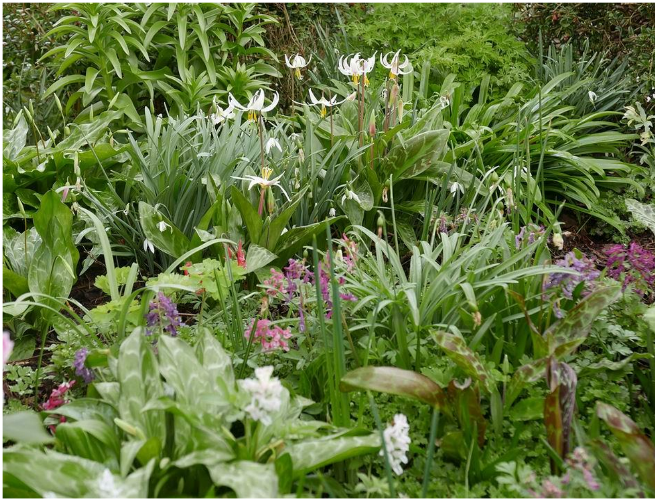
The tall white elegant flowers of Erythronium oregonum stand proud in this mixed planting with the warmer colour provided by forms of Corydalis solida .