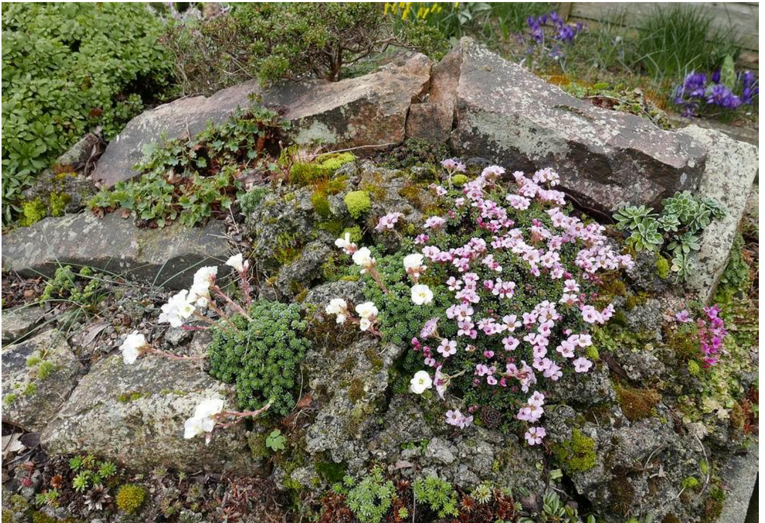
More successes in this slab bed where these saxifrages have grown well over a number of years.