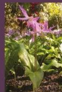
Mahogany fawn lily ( Erythronium revolutum )

100% COUNTRYVILLE NATIONAL TRUST GARDEN OF THE YEAR