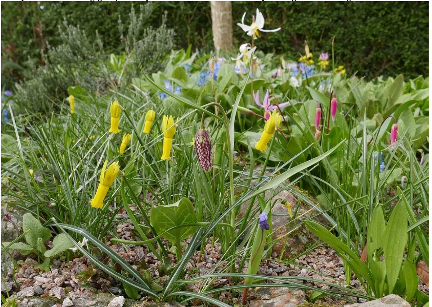
Narcissus cyclamineus flowering in the rock garden where we allow it to self-sow.