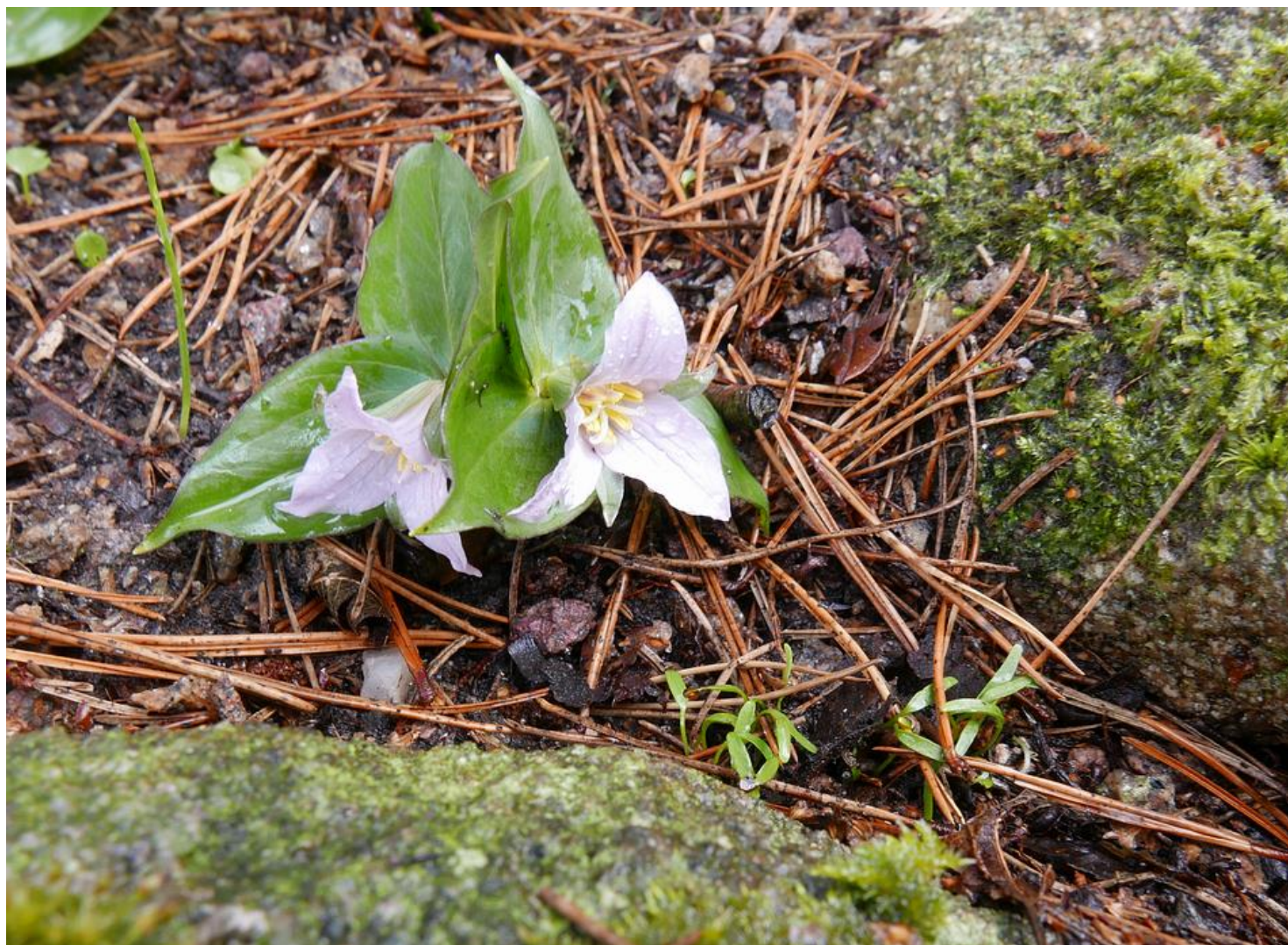
Trillium hibbersonii with a group of seedlings towards the bottom right of the image